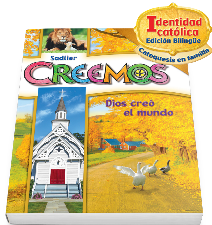
Creemos™ Catholic Identity Edition, Grade K • Spanish