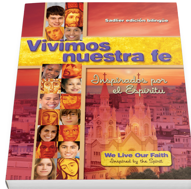
Vivimos nuestra fe, Grade 8 • Bilingual