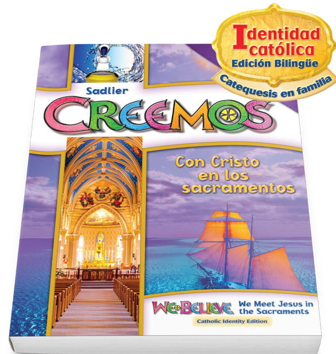
Creemos™ Catholic Identity Edition, Grade 5 • Bilingual