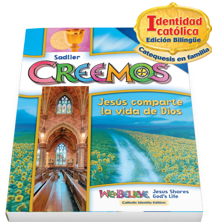
Creemos™ Catholic Identity Edition, Grade 2 • Bilingual